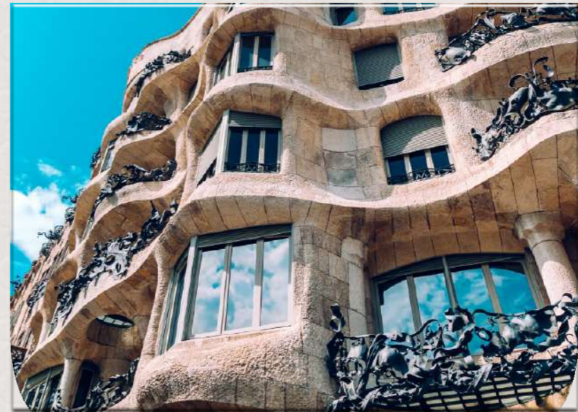
“La Pedrera”’s railings