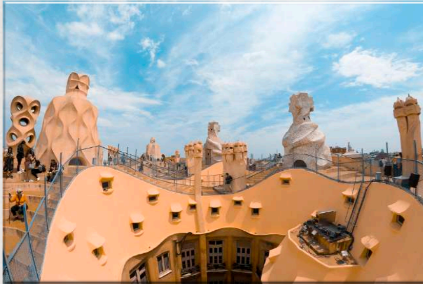
“La Pedrera”’s roof