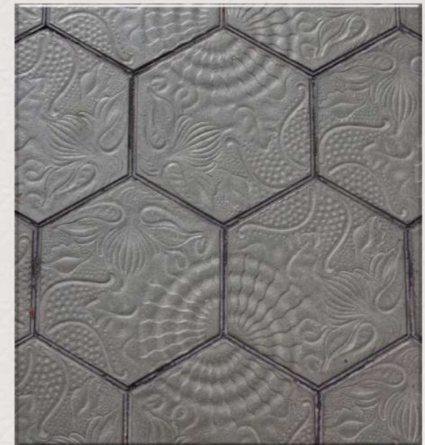
“Passieg de Gracia”’s tiles