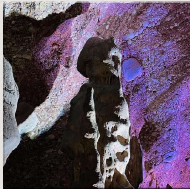
Les coves de Montserrat