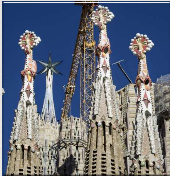
“La Sagrada Família”’s columns