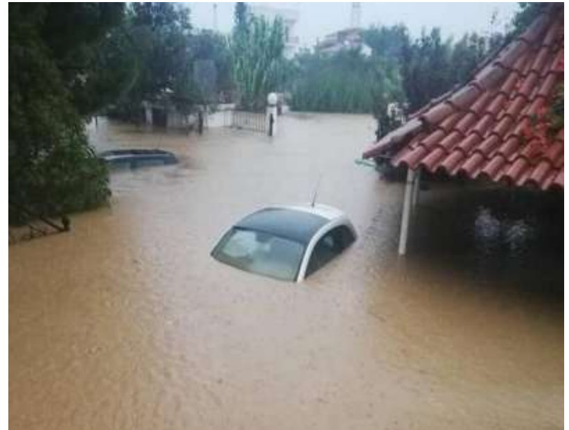
Mandra's flood, Greece, November 2017