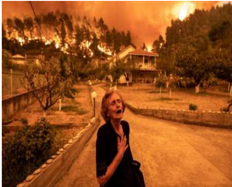
Evia's fire, Greece, August 2021

Another usual natural disaster is fire. If a fire spreads out ,not only is it dangerous for people and animals but also there is no oxygen because trees are destroyed . Additionally, when it rains the water cannot be absorbed by trees and as a result, we are forced to deal with floods.