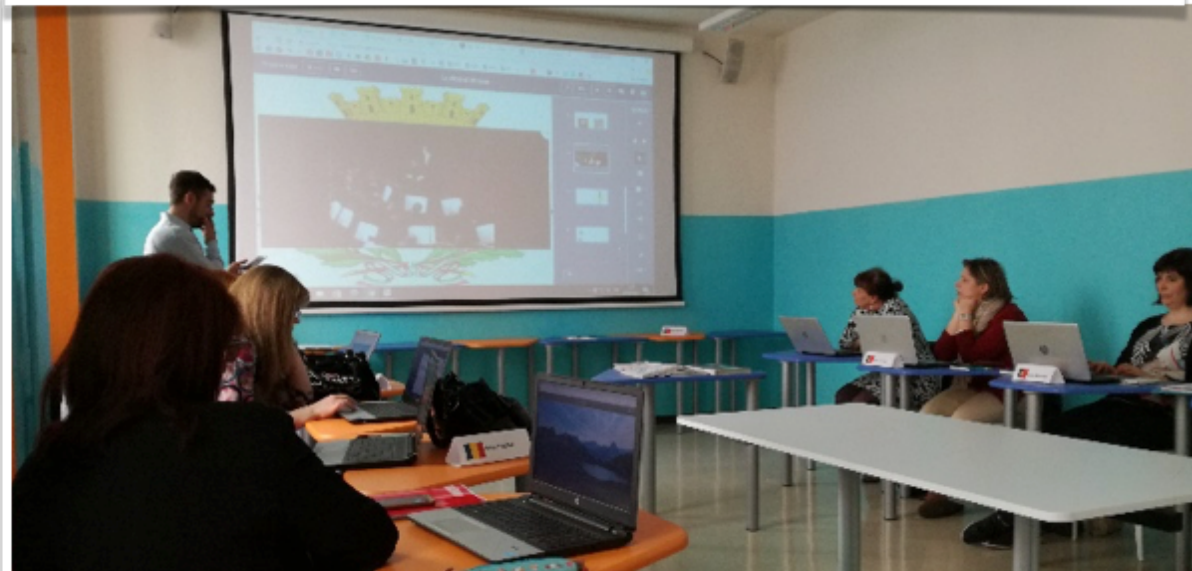
Morning: Mock Sessions of UN Bodies