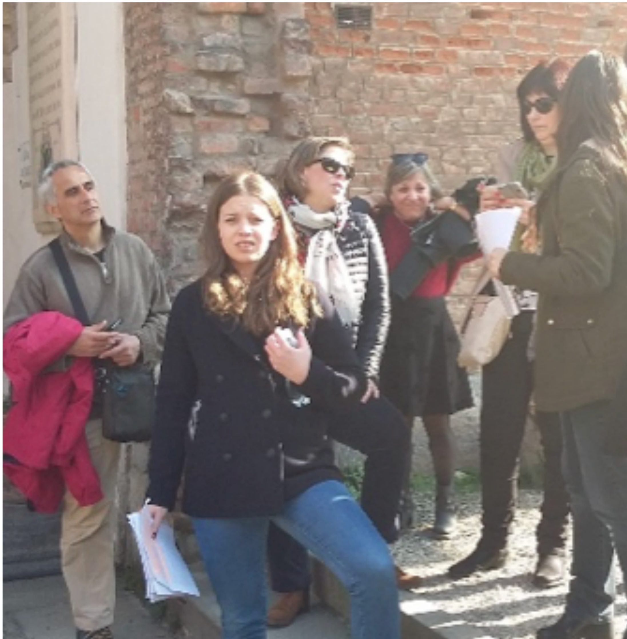
Afternoon: visiting S.Ambrogio, led by students