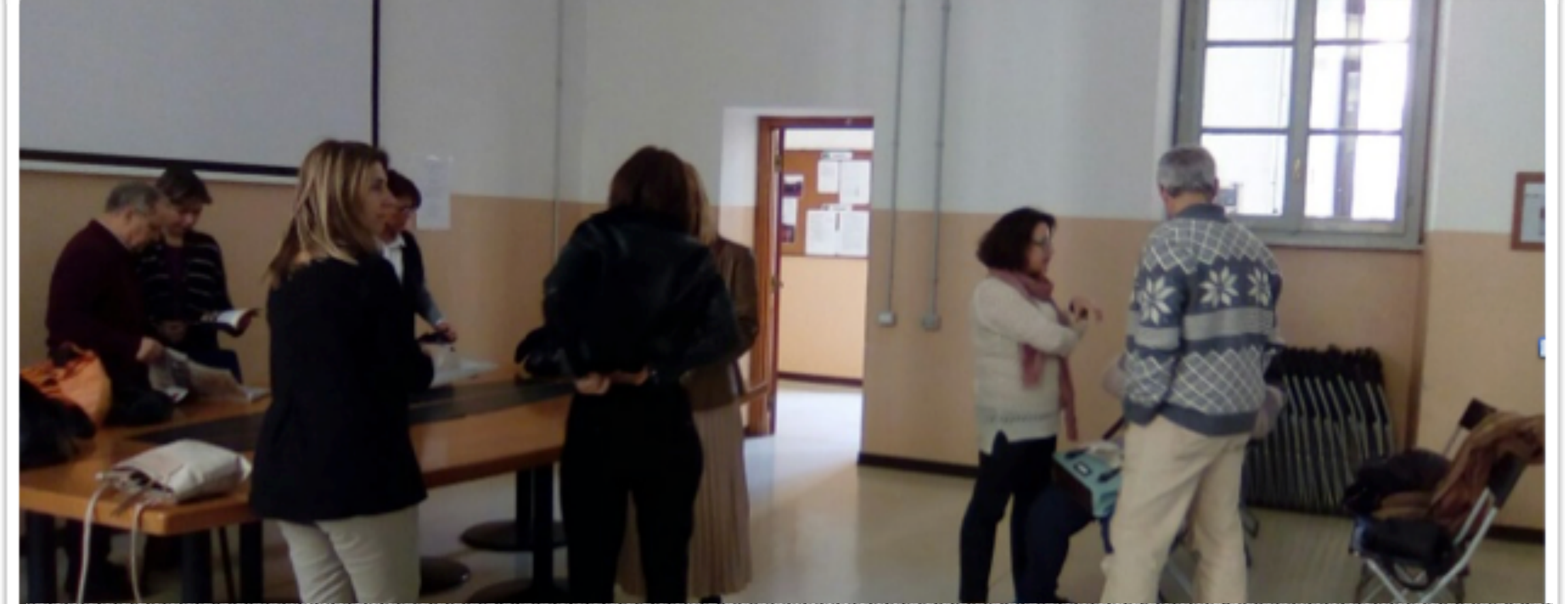
Morning: Discussing our project