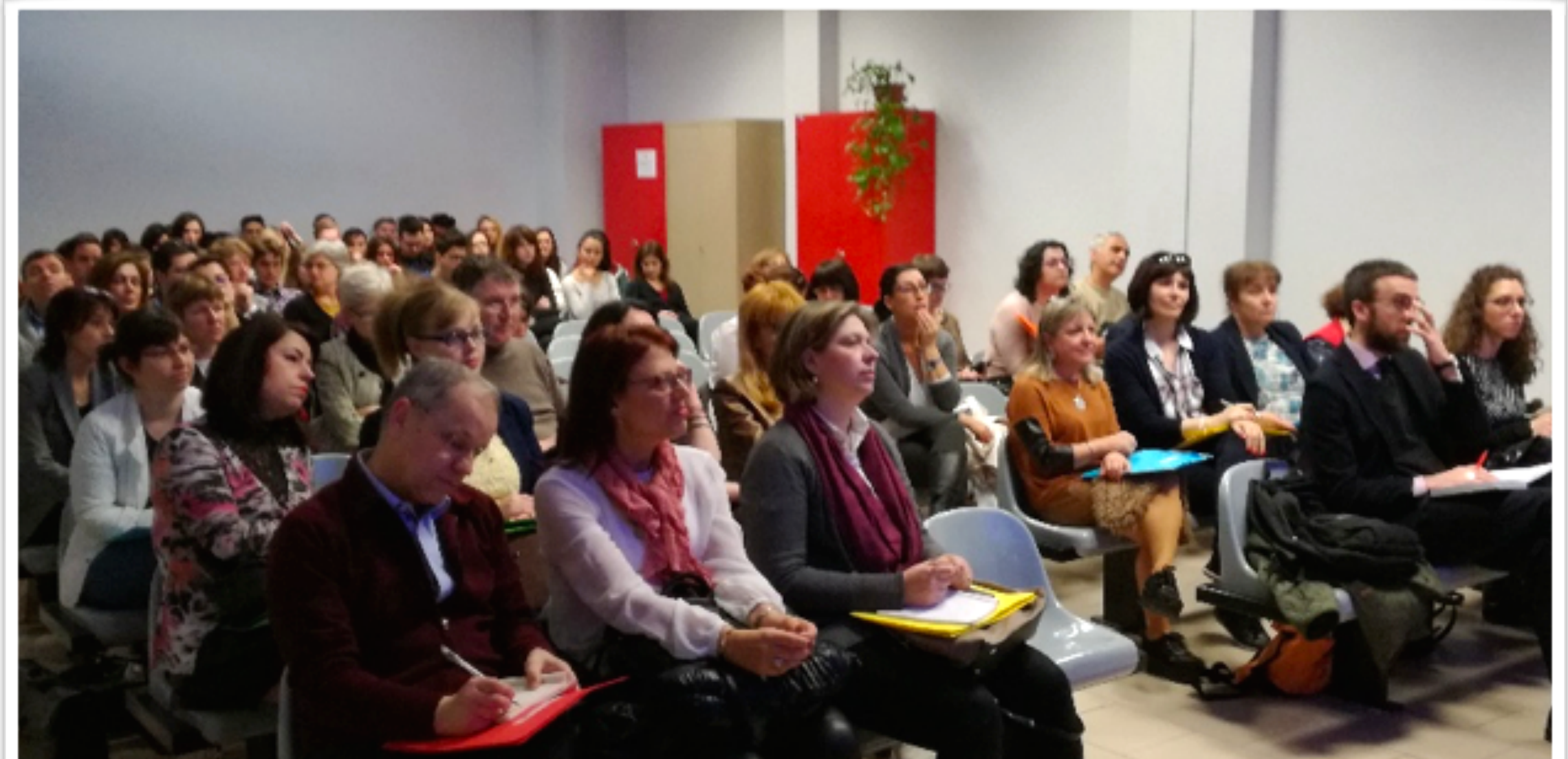
The seminar was open to subject and language teachers